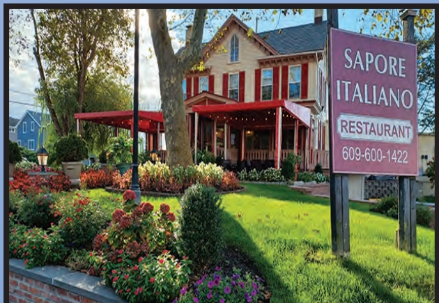
ENJOY FINE ITALIAN CUISINE AT SAPORE ITALIANO IN WEST CAPE MAY • SEE PAGE 12