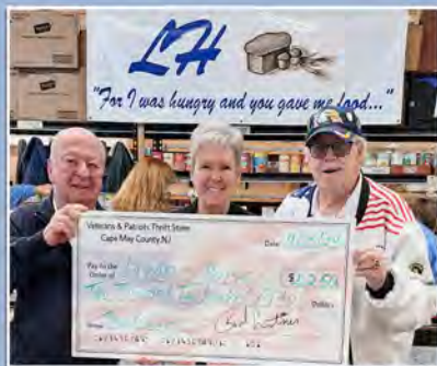
HELPING VETERANS & OTHERS IN NEED!

BUYERS CLUB SHOP 20 TIMES & GET $10 OFF OR $10 WORTH-OF FREE STUFF