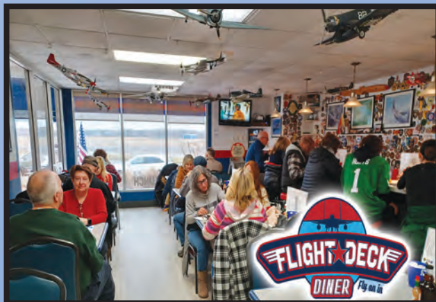
FLY ON IN TO THE FLIGHT DECK DINER FOR BREAKFAST & LUNCH • SEE PAGE 10