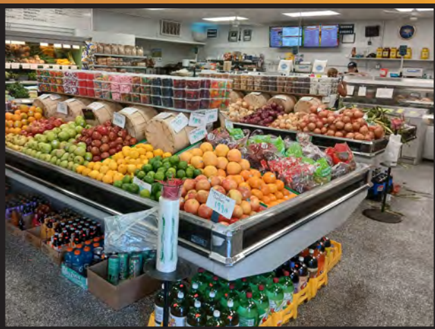
CHECK OUT THIS WEEK'S SPECIALS AT THE PRODUCE PLACE • SEE PAGE 19