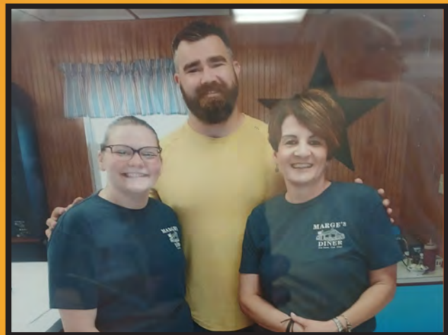
ENJOY BREAKFAST OR LUNCH (LIKE JASON KELCE) AT MARGE'S DINER • SEE PAGE 15