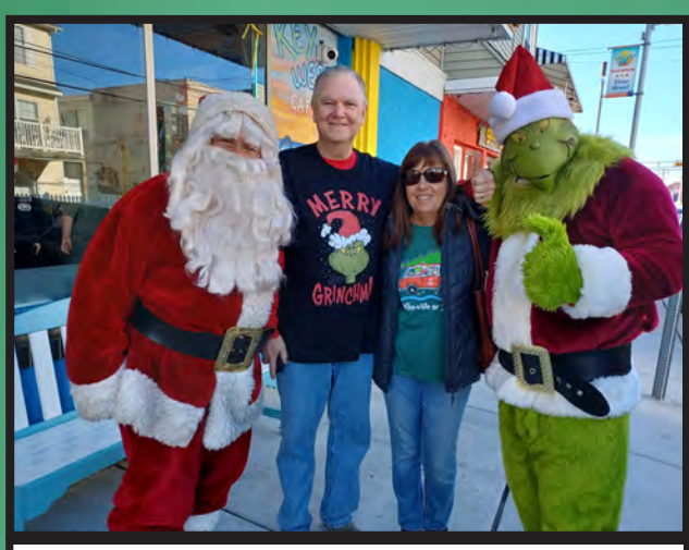
HAVE BREAKFAST WITH THE GRYNCH SUNDAY AT KEY WEST CAFE • SEE PAGE 10