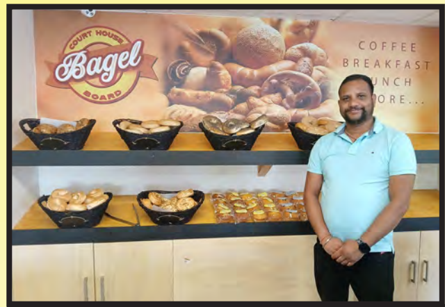
FOR BREAKFAST OR LUNCH, CHECK OUT THE ALL NEW COURT HOUSE BAGEL BOARD • SEE PAGE 17

The STATION HOUSE BRUNCH AT MUDHEN BREWING CO. SATURDAY & SUNDAY 9AM - 2PM