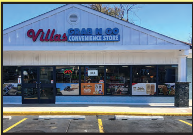
VILLAS GRAB-N-GO CONVENIENCE STORE IS NOW OPEN! • SEE PAGE 2